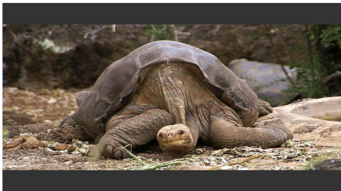
Pinta Giant Tortoise: Extinct

Place all ingredients in a medium bowl and toss to combine. Spread in a single layer on a rimmed baking sheet. Roast for 10 minutes, stirring once or twice during cooking. Let cool and enjoy!