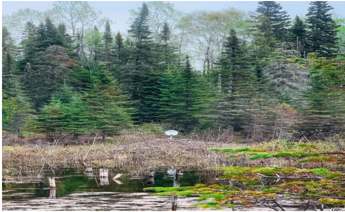
Beaver Hut with Satellite Service, Thunder Bay